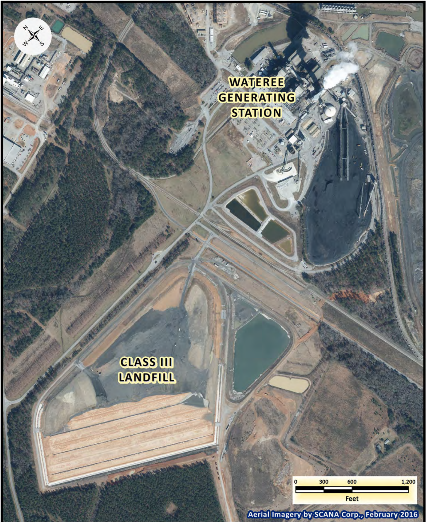
Figure 1 – Site Location Wateree Station Landfill